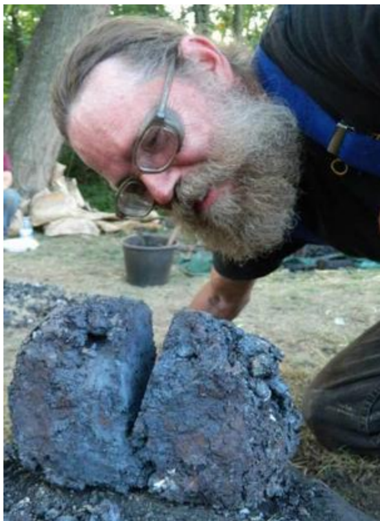
Bloom made at the ARTEfakty Event, Poland 2016

In discussions between experienced and first time iron makers, the two most common questions are : 'Will this work? and 'What went wrong?'. Core to understanding both of these questions is always 'What did you do?'