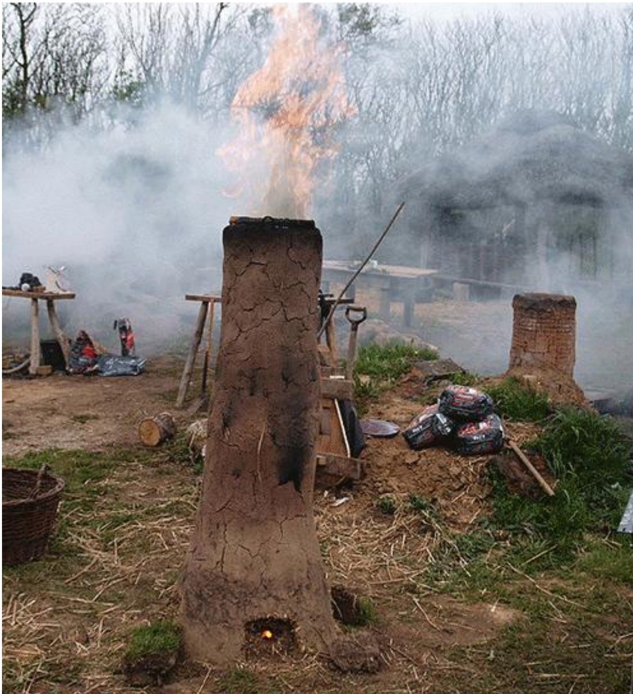
'Iron at Thy' Symposium, Heltborg Denmark, 2008

number of regional to international scope symposiums in Europe, especially over the last decade. ( 8 ) As interest in bloomery iron as a material has filtered back into the blacksmithing community across Europe, increasingly the overall result is a productive blending of approaches, experiences, and skills seen at these events.