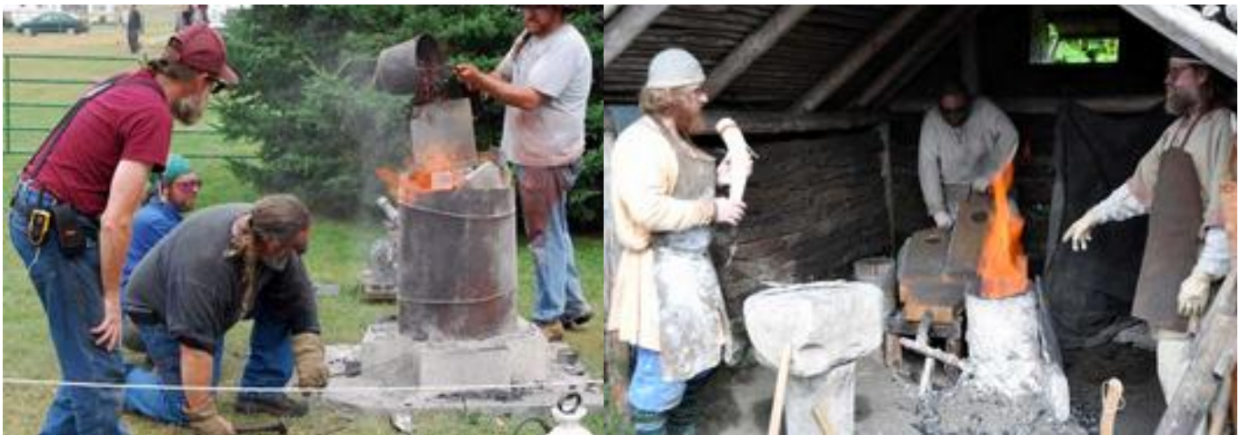
Demonstration at CanIRON 8, Fergus Canada, 2011 (blacksmith's conference) Experiment at L'Anse aux Meadows NHSC, Canada, 2010 (living history presentation) The author with members of his smelt team

There is most obviously going to be a direct relationship between the person who is undertaking the smelting process, and what their intended end results might be. Someone mounting a public demonstration may be most concern with information flow and even visual drama (and not actual iron production results). Those without significant institutional or economic support are unlikely to have access to instrumentation (ability to measure temperatures is a prime example). There are a number of aspects when describing both the process and the resulting iron that are very subjective, often based on previous smelting or associated metalworking experience (A good example would be the 'feel' of a bloom as it is compacted, and how this helps define density or even carbon content). Those most focussed on the end result of converting ore through bloom into working bars is likely to be most be most concerned with overall bloom yields and metal 'quality' - and may have little interest in slag remains at all.